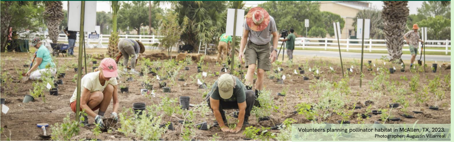
Volunteers planting pollinator habitat in McAllen, TX, 2023.